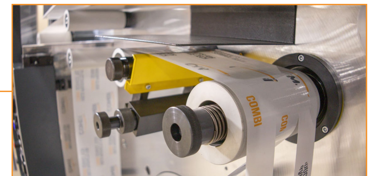
Razor blades slitting station cutting on the adhesive side of the tape.

Parts and technical support are just a click away at the online Combi parts store. Boost your business with a dynamic Siat® EZ-Print™ flexographic machine.