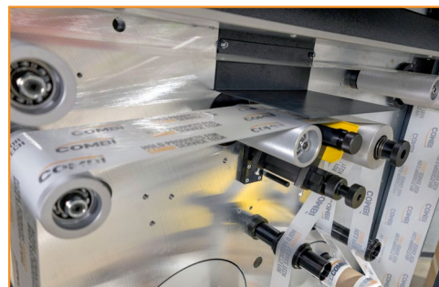
Primer and Release coating stations with knurled aluminium pressure rollers to keep the tape in contact with the chemical solution also during high speed working cycles.