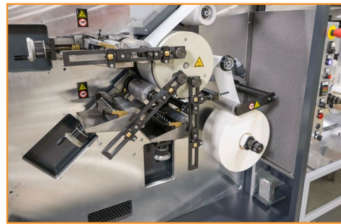
Three color flexographic printing stations with quick adjustment

Unlock new revenue and brand-building opportunities with our compact flexographic tape printing machines — designed specifically for short-run customization and on-demand printing. Whether you're a distributor looking to increase margins or a print house seeking to offer branded tape as a value-added service, this solution makes short-run printing profitable, practical, and EZ.