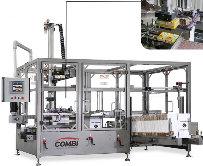
ALPHAPACK® 15/20 Integrated Case Erector and Bottom Sealer