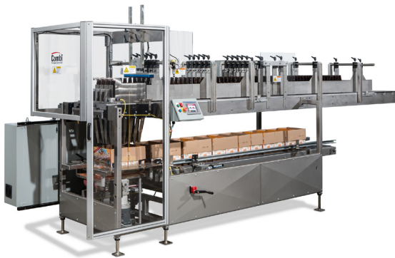
Ultra-compact Drop Packers with or without Integrated Case Erectors