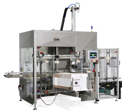
Top loading Servo Pick and Place Packers featuring multi-axis servos for precise and safe placement of products into erected cases