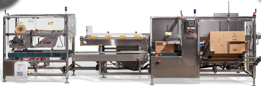
ERFOPACK® HAND PACKING STATION 2-EZ® SB SSTL Ergopack®