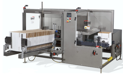
Case Erectors, Bottom Tapers to erect and seal small to extra large cases from 8 to 35 cases per minute