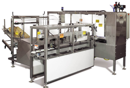
Side Loading Horizontal Loaders with or without Integrated Case Erectors