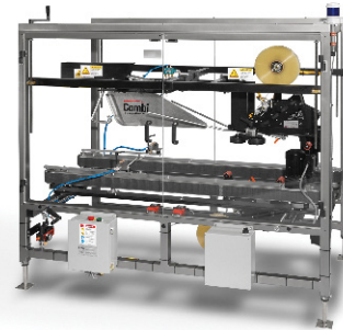
Automatic, Heavy Duty Case Sealers, Stand-Alone or System Integrated, top and/or bottom sealing up to 50 cases per minute